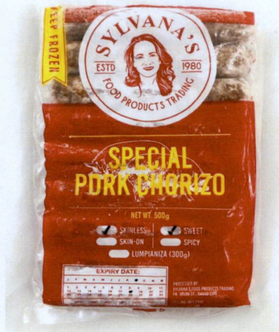
Figure 1. Unregistered SYLVANA'S Food Products Trading Special Pork Chorizo Skinless, Sweet

The Food and Drug Administration (FDA) warns all healthcare professionals and the general public NOT TO PURCHASE AND CONSUME the unregistered food product: