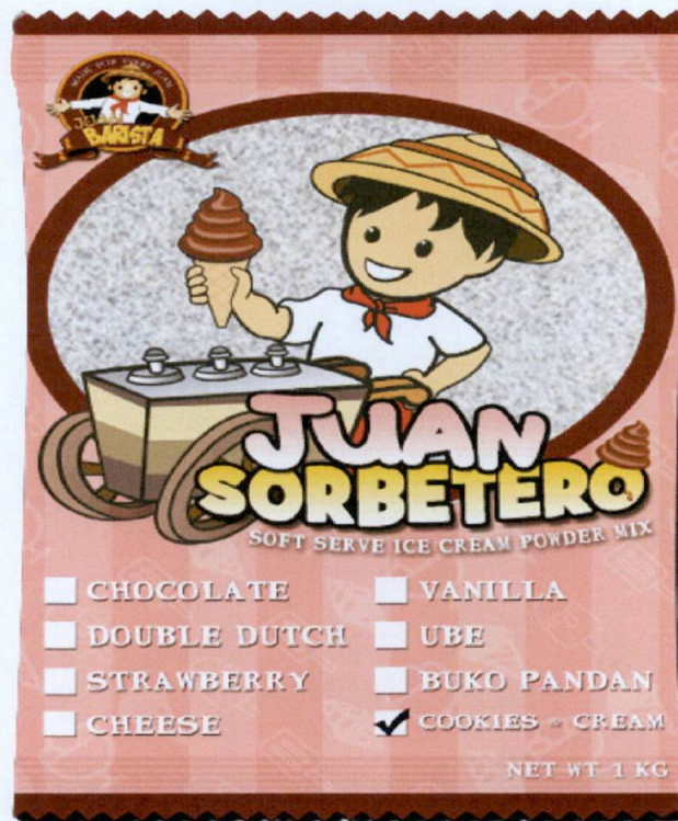
Figure 1. Unregistered JUAN SORBETERO Soft Serve Ice Cream Powder Mix Cookies & Cream

The Food and Drug Administration (FDA) warns all healthcare professionals and the general public NOT TO PURCHASE AND CONSUME the unregistered food product: