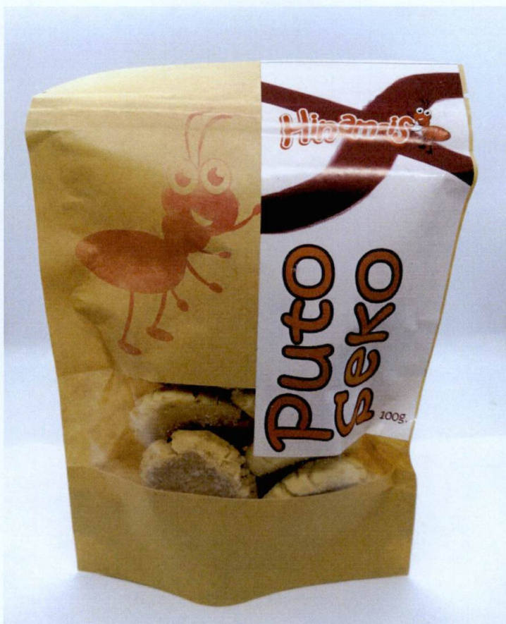
Figure 1. Unregistered HINAM-IS Puto Seko

The Food and Drug Administration (FDA) warns all healthcare professionals and the general public NOT TO PURCHASE AND CONSUME the unregistered food product: