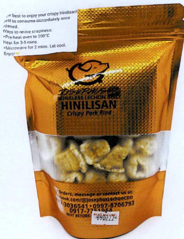
Figure 1. Unregistered JOSEPHUS Boneless Lechon Belly Hinilisan Crispy Pork Rind

The Food and Drug Administration (FDA) warns all healthcare professionals and the general public NOT TO PURCHASE AND CONSUME the unregistered food product: