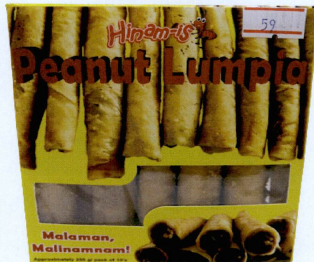
Figure 1. Unregistered HINAM-IS Peanut Lumpia

The Food and Drug Administration (FDA) warns all healthcare professionals and the general public NOT TO PURCHASE AND CONSUME the unregistered food product: