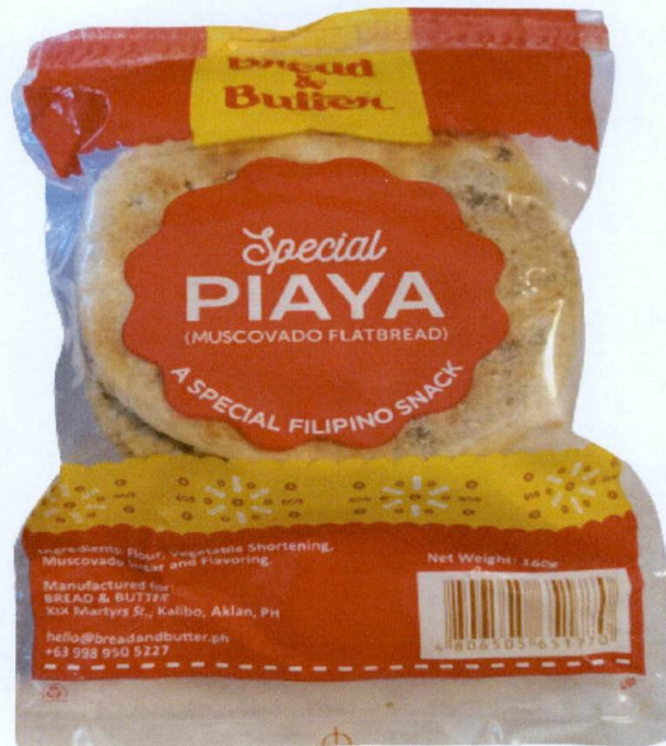
Figure 1. Unregistered BREAD & BUTTER Special Piaya (Muscovado Flatbread)

The Food and Drug Administration (FDA) warns all healthcare professionals and the general public NOT TO PURCHASE AND CONSUME the unregistered food product: