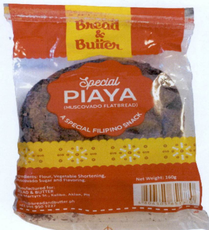
Figure 1. Unregistered BREAD & BUTTER Special Piaya (Muscovado Flatbread)

The Food and Drug Administration (FDA) warns all healthcare professionals and the general public NOT TO PURCHASE AND CONSUME the unregistered food product: