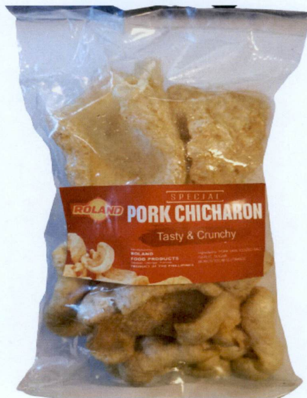
Figure 1. Unregistered ROLAND Special Pork Chicharon

The Food and Drug Administration (FDA) warns all healthcare professionals and the general public NOT TO PURCHASE AND CONSUME the unregistered food product: