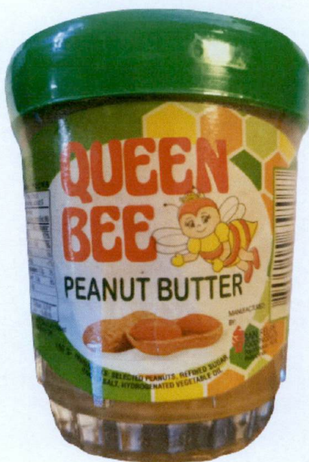
Figure 1. Unregistered QUEEN BEE Peanut Butter

The Food and Drug Administration (FDA) warns all healthcare professionals and the general public NOT TO PURCHASE AND CONSUME the unregistered food product: