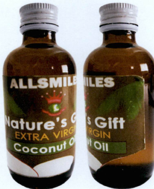
Figure 1. Unregistered ALLSMILES Nature's Gift Extra Virgin Coconut Oil

The Food and Drug Administration (FDA) warns all healthcare professionals and the general public NOT TO PURCHASE AND CONSUME the unregistered food product: