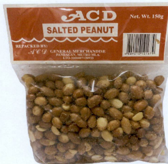
Figure 1. Unregistered ACD Salted Peanut

The Food and Drug Administration (FDA) warns all healthcare professionals and the general public NOT TO PURCHASE AND CONSUME the unregistered food product: