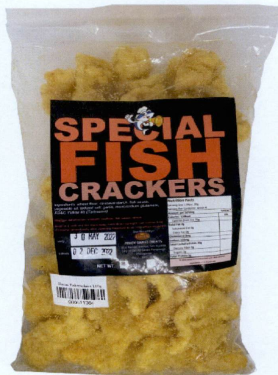
Figure 1. Unregistered SPECIAL Fish Crackers

The Food and Drug Administration (FDA) warns all healthcare professionals and the general public NOT TO PURCHASE AND CONSUME the unregistered food product: