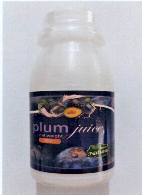
Figure 1. Unregistered UNBRANDED Plum Juice

The Food and Drug Administration (FDA) warns all healthcare professionals and the general public NOT TO PURCHASE AND CONSUME the unregistered food product: