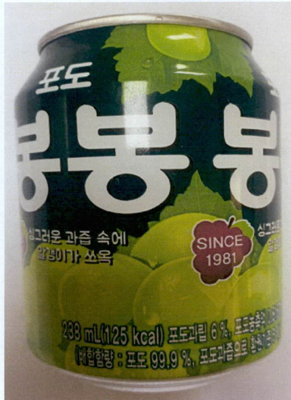
Figure 1. Unregistered Drink with Green Label and Image of White Grapes in Can (In Foreign Language)

The Food and Drug Administration (FDA) warns all healthcare professionals and the general public NOT TO PURCHASE AND CONSUME the unregistered food product: