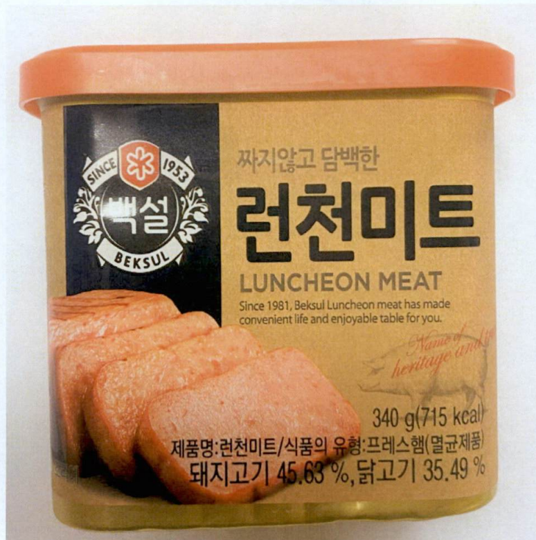
Figure 1. Unregistered BEKSUL Luncheon Meat (In Foreign Language)

The Food and Drug Administration (FDA) warns all healthcare professionals and the general public NOT TO PURCHASE AND CONSUME the unregistered food product: