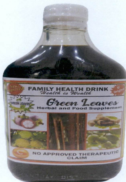
Figure 1. Unregistered FAMILY HEALTH DRINK Green Leaves Herbal and Food Supplement

The Food and Drug Administration (FDA) warns all healthcare professionals and the general public NOT TO PURCHASE AND CONSUME the unregistered food supplement: