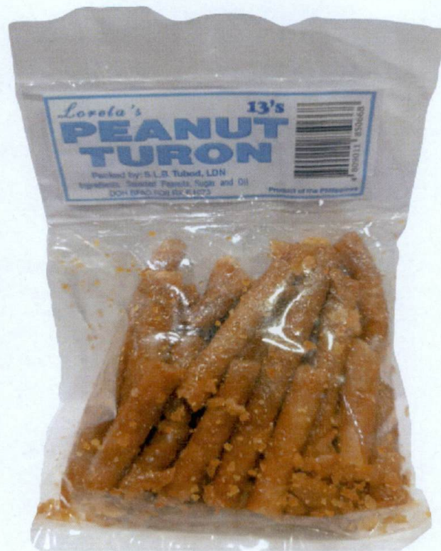
Figure 1. Unregistered LORETA'S Peanut Turon

The Food and Drug Administration (FDA) warns all healthcare professionals and the general public NOT TO PURCHASE AND CONSUME the unregistered food product: