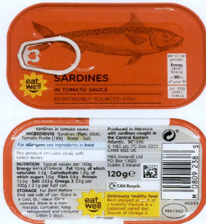
Figure 1. Unregistered M&S FOOD Sardines in Tomato Sauce

The Food and Drug Administration (FDA) warns all healthcare professionals and the general public NOT TO PURCHASE AND CONSUME the unregistered food product: