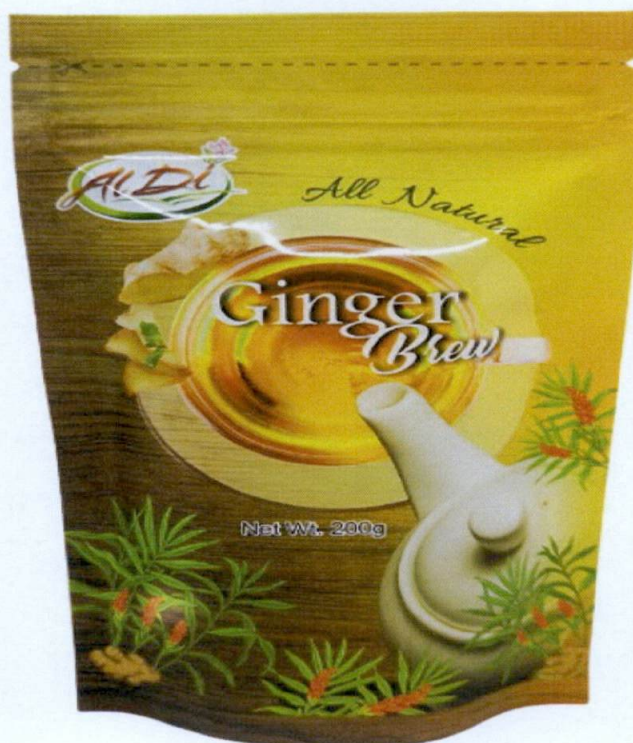
Figure 1. Unregistered AL DI All Natural Ginger Brew

The Food and Drug Administration (FDA) warns all healthcare professionals and the general public NOT TO PURCHASE AND CONSUME the unregistered food product: