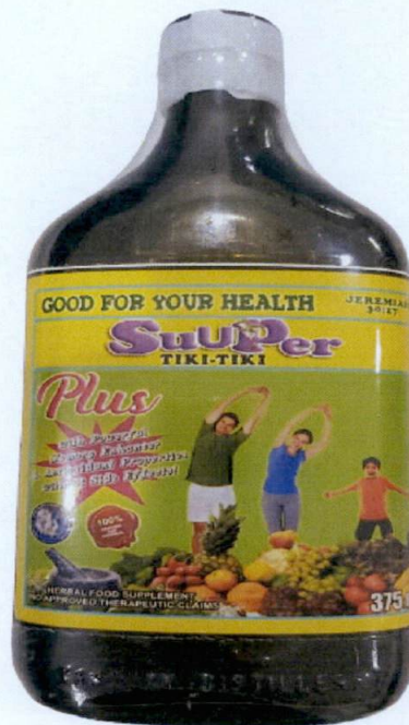
Figure 1. Unregistered SUUPER Tiki-Tiki Plus Herbal Food Supplement

The Food and Drug Administration (FDA) warns all healthcare professionals and the general public NOT TO PURCHASE AND CONSUME the unregistered food supplement: