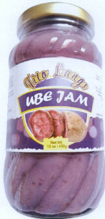
Figure 1. Unregistered TITO LANGS Ube Jam

The Food and Drug Administration (FDA) warns all healthcare professionals and the general public NOT TO PURCHASE AND CONSUME the unregistered food product: