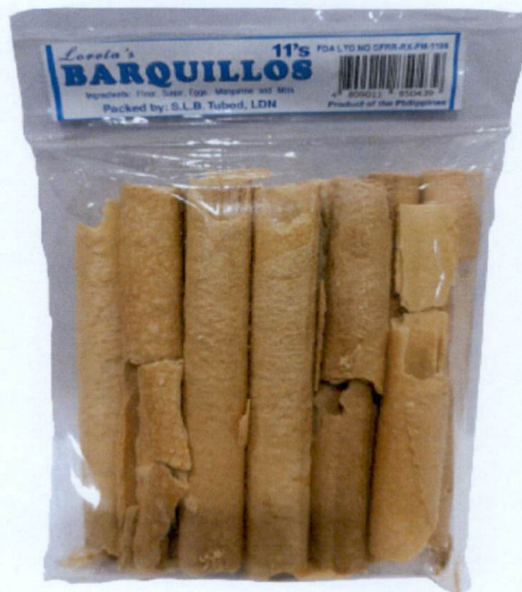
Figure 1. Unregistered LORETA'S Barquillos

The Food and Drug Administration (FDA) warns all healthcare professionals and the general public NOT TO PURCHASE AND CONSUME the unregistered food product: