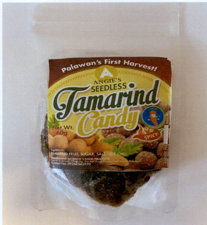
Figure 1. Unregistered ANGIE'S Seedless Tamarind Candy Spicy

The Food and Drug Administration (FDA) warns all healthcare professionals and the general public NOT TO PURCHASE AND CONSUME the unregistered food product: