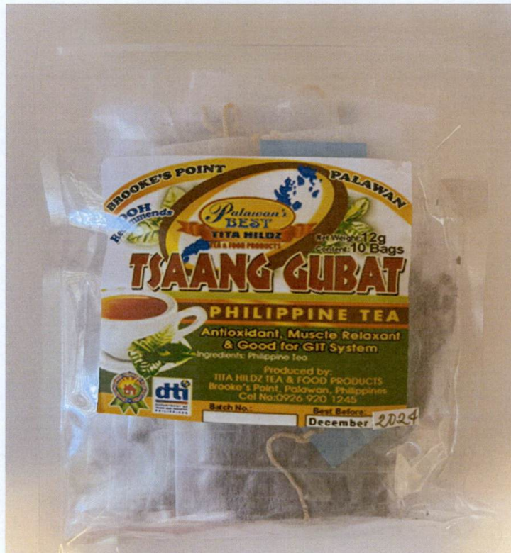
Figure 1. Unregistered TITA HILDZ Tsaang Gubat Philippine Tea

The Food and Drug Administration (FDA) warns all healthcare professionals and the general public NOT TO PURCHASE AND CONSUME the unregistered food product: