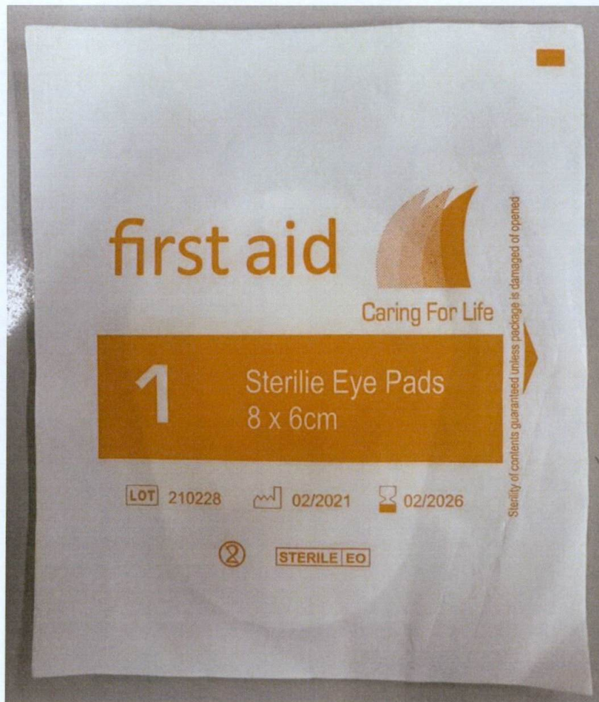
Figure 1. Unnotified first aid Caring For Life Sterile Eye Pads 8 x 6cm

The Food and Drug Administration (FDA) warns all healthcare professionals and the general public NOT TO PURCHASE AND USE the unnotified medical device product: