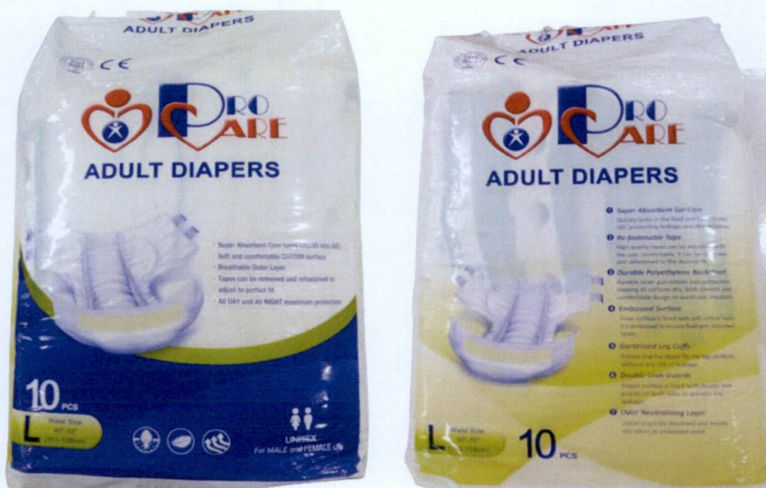
Figure 1. Unnotified ProCare Adult Diapers

The Food and Drug Administration (FDA) warns all healthcare professionals and the general public NOT TO PURCHASE AND USE the unnotified medical device product: