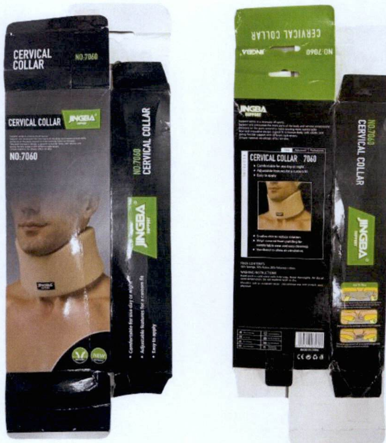
Figure 1. Unnotified JINGBA® SUPPORT CERVICAL COLLAR NO:7060

The Food and Drug Administration (FDA) warns all healthcare professionals and the general public NOT TO PURCHASE AND USE the following unnotified medical device products: