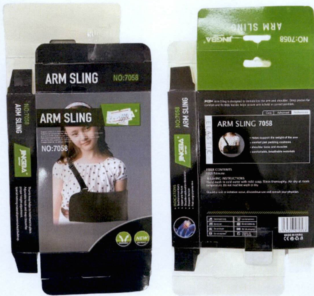
Figure 2. Unnotified JINGBA® SUPPORT ARM SLING NO:7058

The FDA verified through post-marketing surveillance that the abovementioned medical device products are not notified and no corresponding Product Notification Certificate have been issued. Pursuant to the Republic Act No. 9711, otherwise known as the “Food and Drug Administration Act of 2009”, the manufacture, importation, exportation, sale, offering for sale, distribution, transfer, non-consumer use, promotion, advertising or sponsorship of health products without the proper authorization is prohibited.