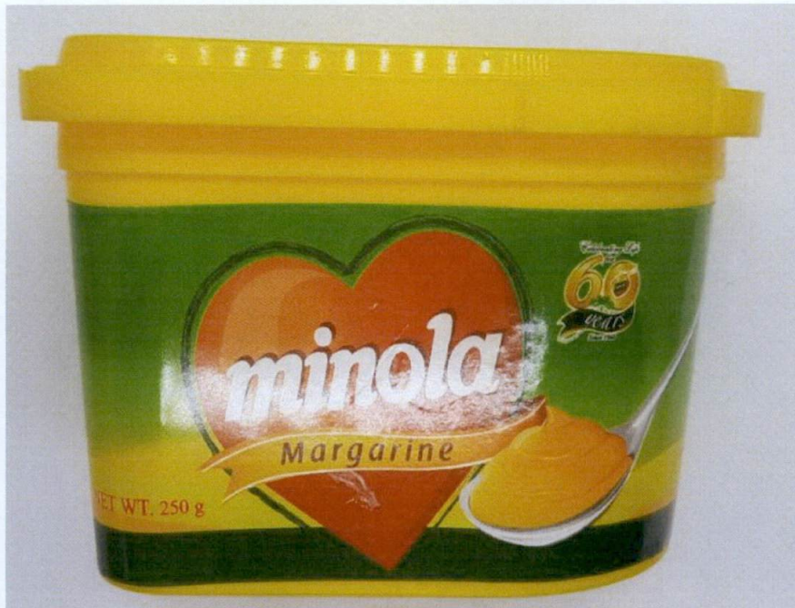
Figure 1. Unregistered MINOLA Margarine

The Food and Drug Administration (FDA) warns all healthcare professionals and the general public NOT TO PURCHASE AND CONSUME the unregistered food product: