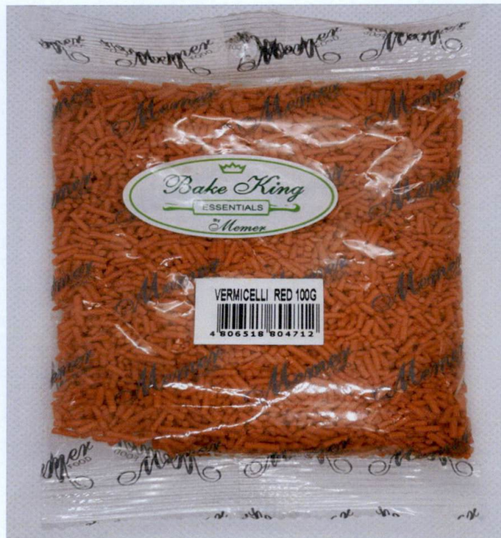
Figure 1. Unregistered BAKE KING ESSENTIALS BY MEMER Vermicelli Red

The Food and Drug Administration (FDA) warns all healthcare professionals and the general public NOT TO PURCHASE AND CONSUME the unregistered food product: