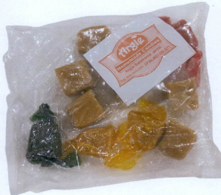
Figure 1. Unregistered ARGIE Homemade Candies

The Food and Drug Administration (FDA) warns all healthcare professionals and the general public NOT TO PURCHASE AND CONSUME the unregistered food product: