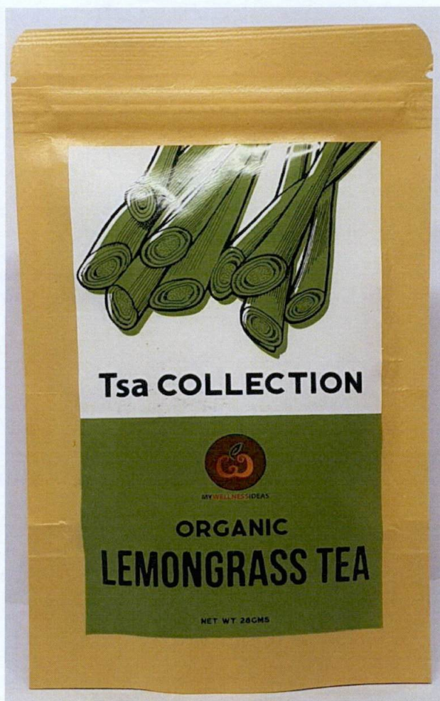
Figure 1. Unregistered TSA COLLECTION Organic Lemongrass Tea

The Food and Drug Administration (FDA) warns all healthcare professionals and the general public NOT TO PURCHASE AND CONSUME the unregistered food product: