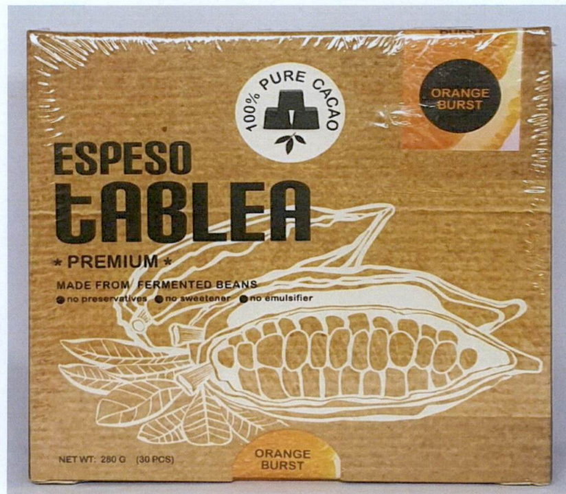
Figure 1. Unregistered ESPESO Tablea 100% Pure Cacao Orange Burst

The Food and Drug Administration (FDA) warns all healthcare professionals and the general public NOT TO PURCHASE AND CONSUME the unregistered food product: