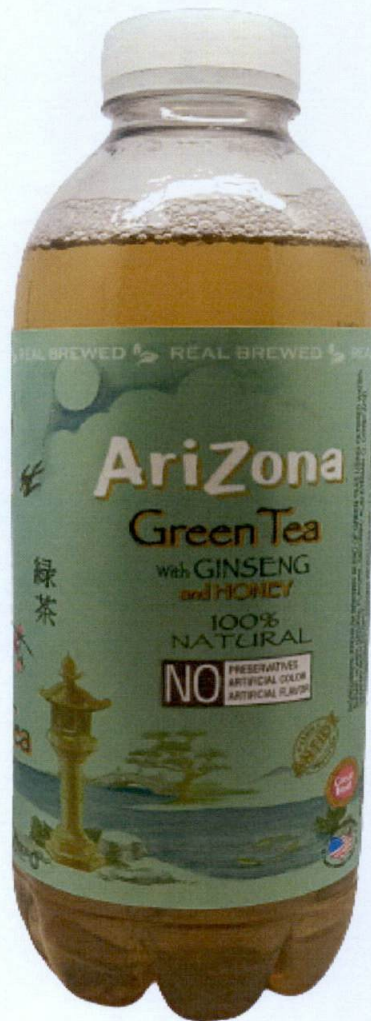
Figure 1. Unregistered ARIZONA Green Tea with Ginseng and Honey

The Food and Drug Administration (FDA) warns all healthcare professionals and the general public NOT TO PURCHASE AND CONSUME the unregistered food product: