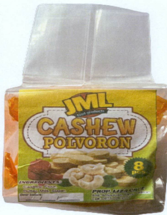
Figure 1. Unregistered JML FOOD PRODUCTS Cashew Polvoron

The Food and Drug Administration (FDA) warns all healthcare professionals and the general public NOT TO PURCHASE AND CONSUME the unregistered food product: