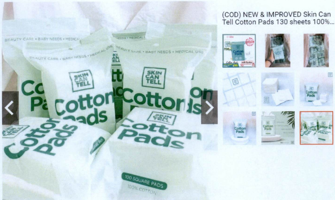
Figure 2. Unnotified Skin Can Tell Cotton Pads

The FDA verified through post-marketing surveillance that the abovementioned medical device product is not notified and no corresponding Product Notification Certificate has been issued. Pursuant to the Republic Act No. 9711, otherwise known as the “Food and Drug Administration Act of 2009”, the manufacture, importation, exportation, sale, offering for sale, distribution, transfer, non-consumer use, promotion, advertising or sponsorship of health products without the proper authorization is prohibited.