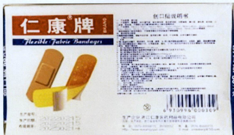
Figure 1. Unnotified Flexible Fabric Bandage (in Foreign Characters) – Zhejiang Renkang Medical Products Co. Ltd.