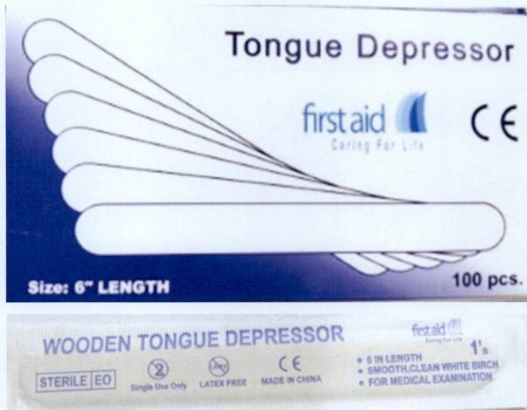
Figure 1. Unnotified First Aid Caring for Life Tongue Depressor 6" Length

The Food and Drug Administration (FDA) warns all healthcare professionals and the general public NOT TO PURCHASE AND USE the unnotified medical device product: