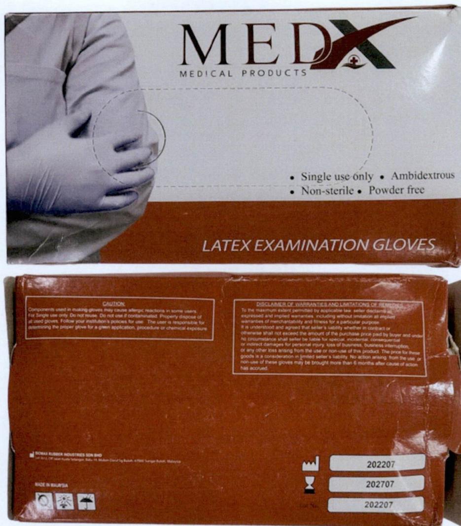
Figure 1. Unnotified MedX Medical Products Latex Examination Gloves (L)

The Food and Drug Administration (FDA) warns all healthcare professionals and the general public NOT TO PURCHASE AND USE the unnotified medical device product: