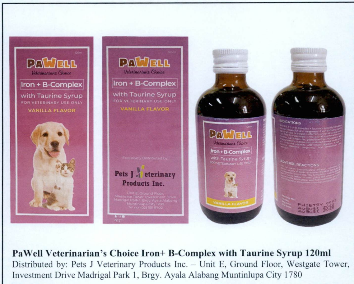
Figure 1. Unregistered veterinary drug product

The Food and Drug Administration (FDA) advises the public against the purchase and use of the following unregistered drug products: