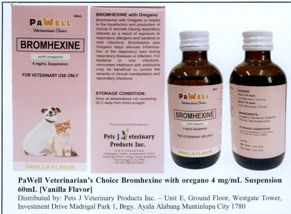
Figure 2. Unregistered veterinary drug product

FDA Post-Marketing Surveillance (PMS) activities have verified that the abovementioned drug products have not gone through the registration process of the Agency and have not been issued with proper authorization in the form of Certificate of Product Registration. Thus, the Agency cannot guarantee their quality, safety and efficacy. Therefore, consumption of such violative products may pose potential danger or injury to health.