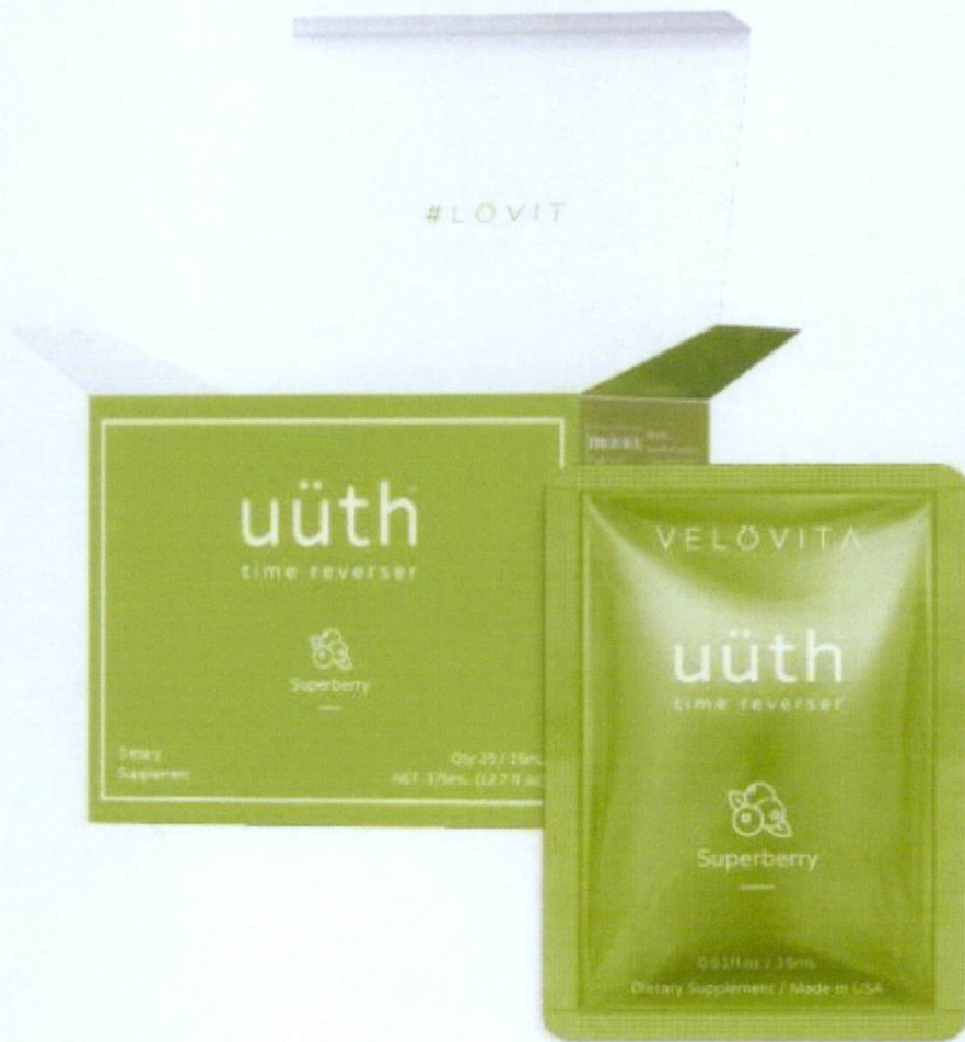
Figure 3. Unregistered VELOVITA UUTH Time Reverser Superberry Dietary Supplement