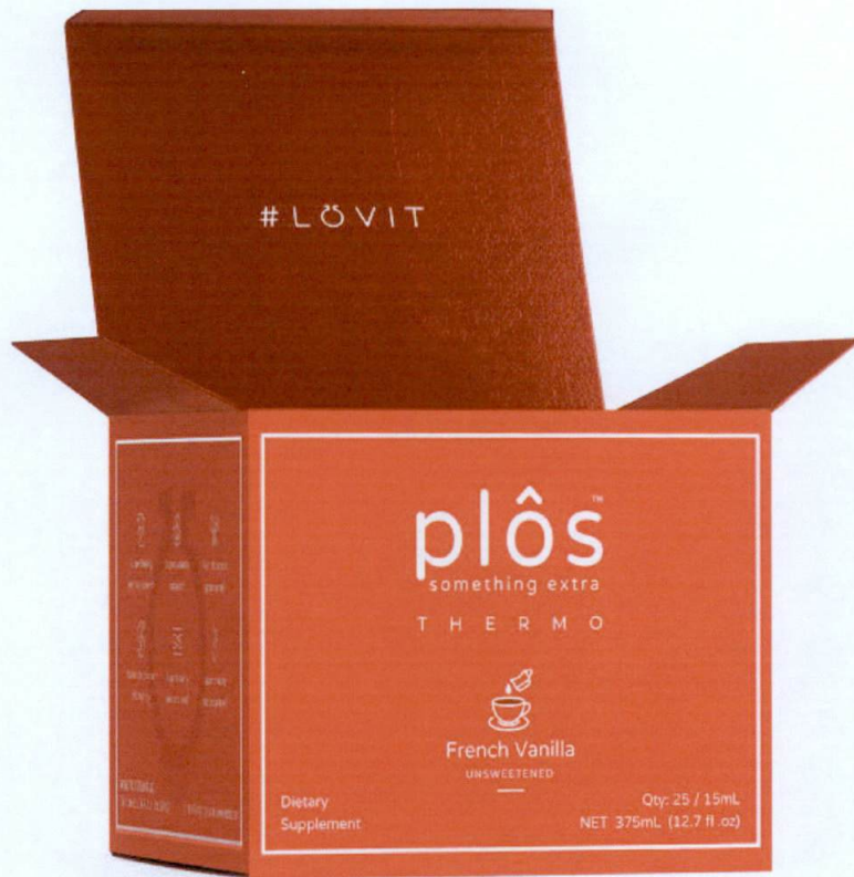
Figure 4. Unregistered PLOS SOMETHING Extra Thermo French Vanilla Dietary Supplement