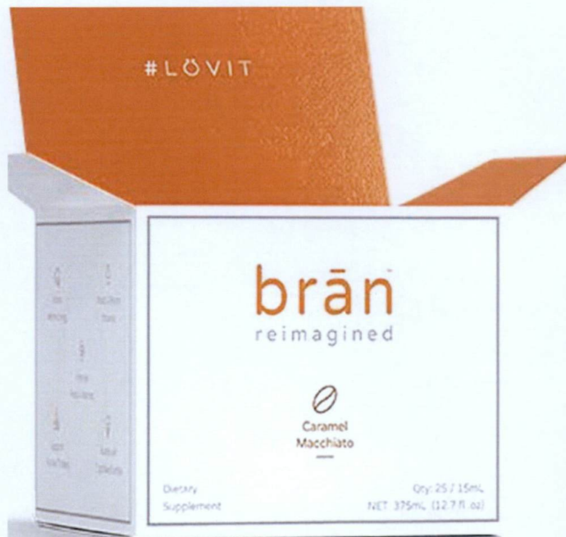
Figure 1. Unregistered VELOVITA BRAN REIMAGINED Caramel Macchiato Dietary Supplement

The Food and Drug Administration (FDA) warns all healthcare professionals and the general public NOT TO PURCHASE AND CONSUME the following unregistered food supplements: