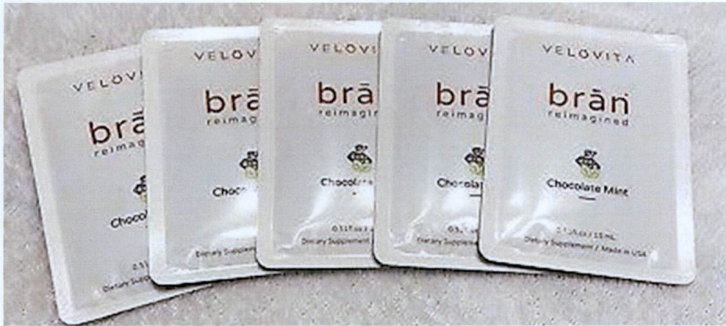
Figure 2. Unregistered PHARMAZINC Alkaline Vitamin C with Essential Minerals Dietary Food Supplement