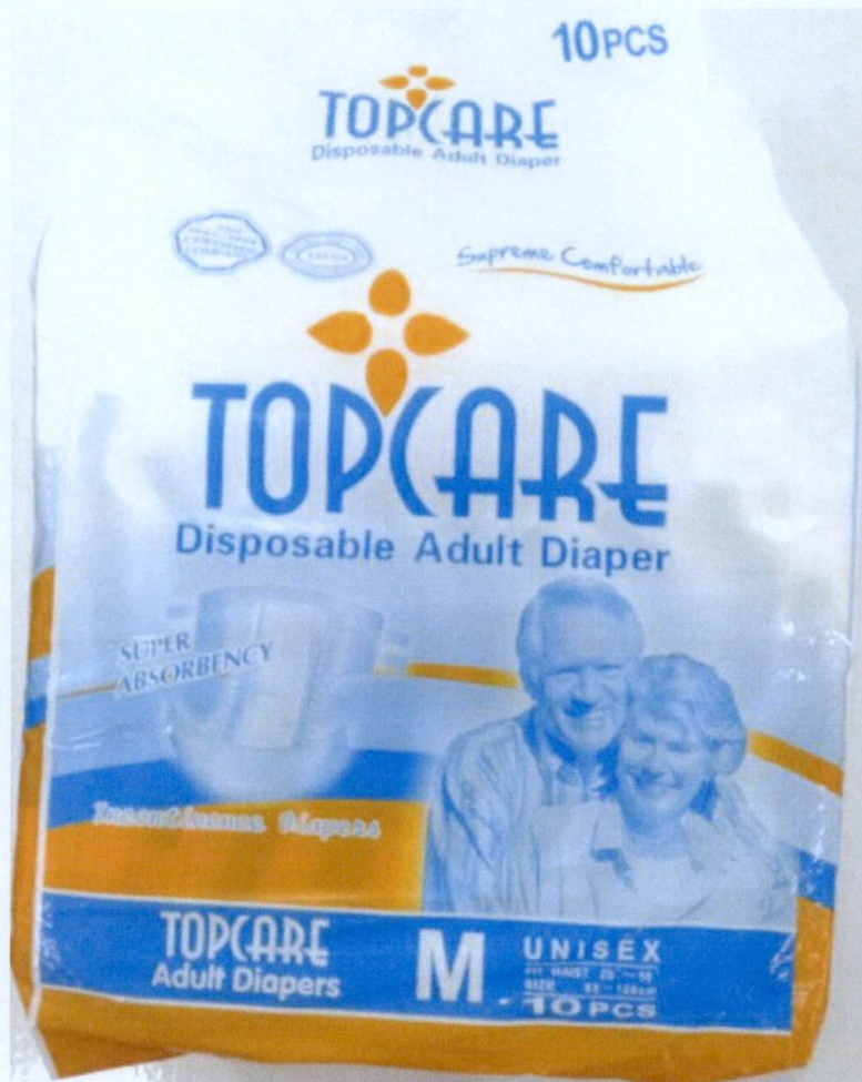
Figure 1. Unnotified Topcare Disposable Adult Diaper (M)

The Food and Drug Administration (FDA) warns all healthcare professionals and the general public NOT TO PURCHASE AND USE the unnotified medical device product: