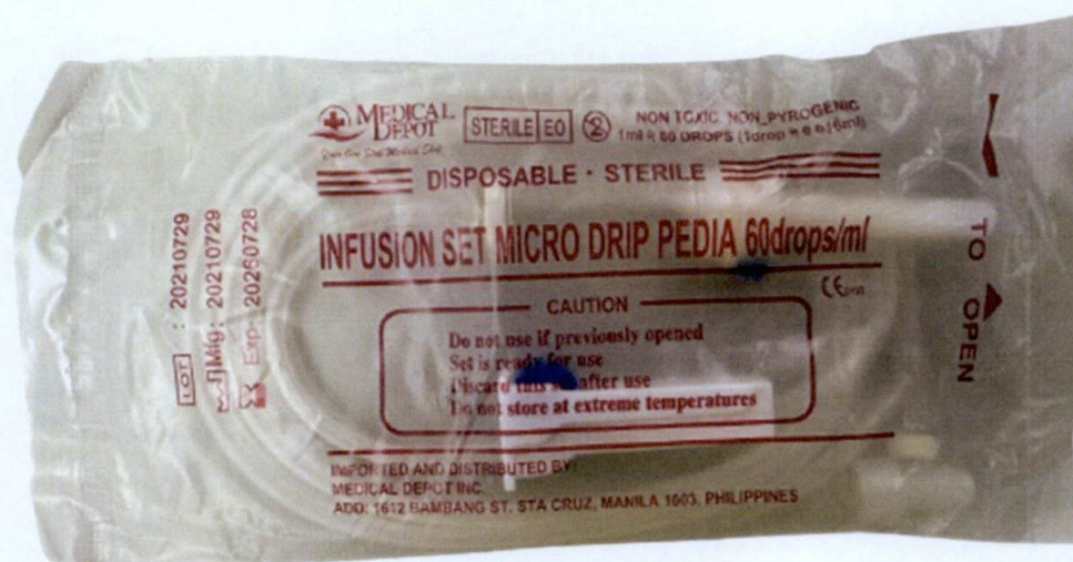
Figure 1. Unnotified Medical Depot Disposable Sterile Infusion Set Micro Drip Pedia 60drops/ml

The Food and Drug Administration (FDA) warns all healthcare professionals and the general public NOT TO PURCHASE AND USE the unnotified medical device product: