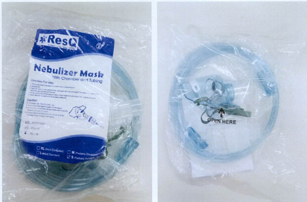
Figure 1. Unregistered ResQ™ Nebulizer Mask with Chamber and Tubing

The Food and Drug Administration (FDA) warns all healthcare professionals and the general public NOT TO PURCHASE AND USE the unregistered medical device product: