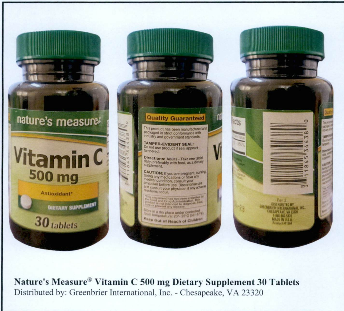
Nature's Measure® Vitamin C 500 mg Dietary Supplement 30 Tablets Distributed by: Greenbrier International, Inc. - Chesapeake, VA 23320

The Food and Drug Administration (FDA) advises the public against the purchase and use of the unregistered drug product: