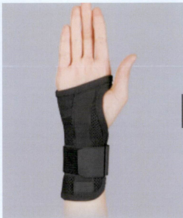
Nippon Sigmax Wrist Faciliaid

The Food and Drug Administration (FDA) warns all healthcare professionals and the general public NOT TO PURCHASE AND USE the unnotified medical device product: