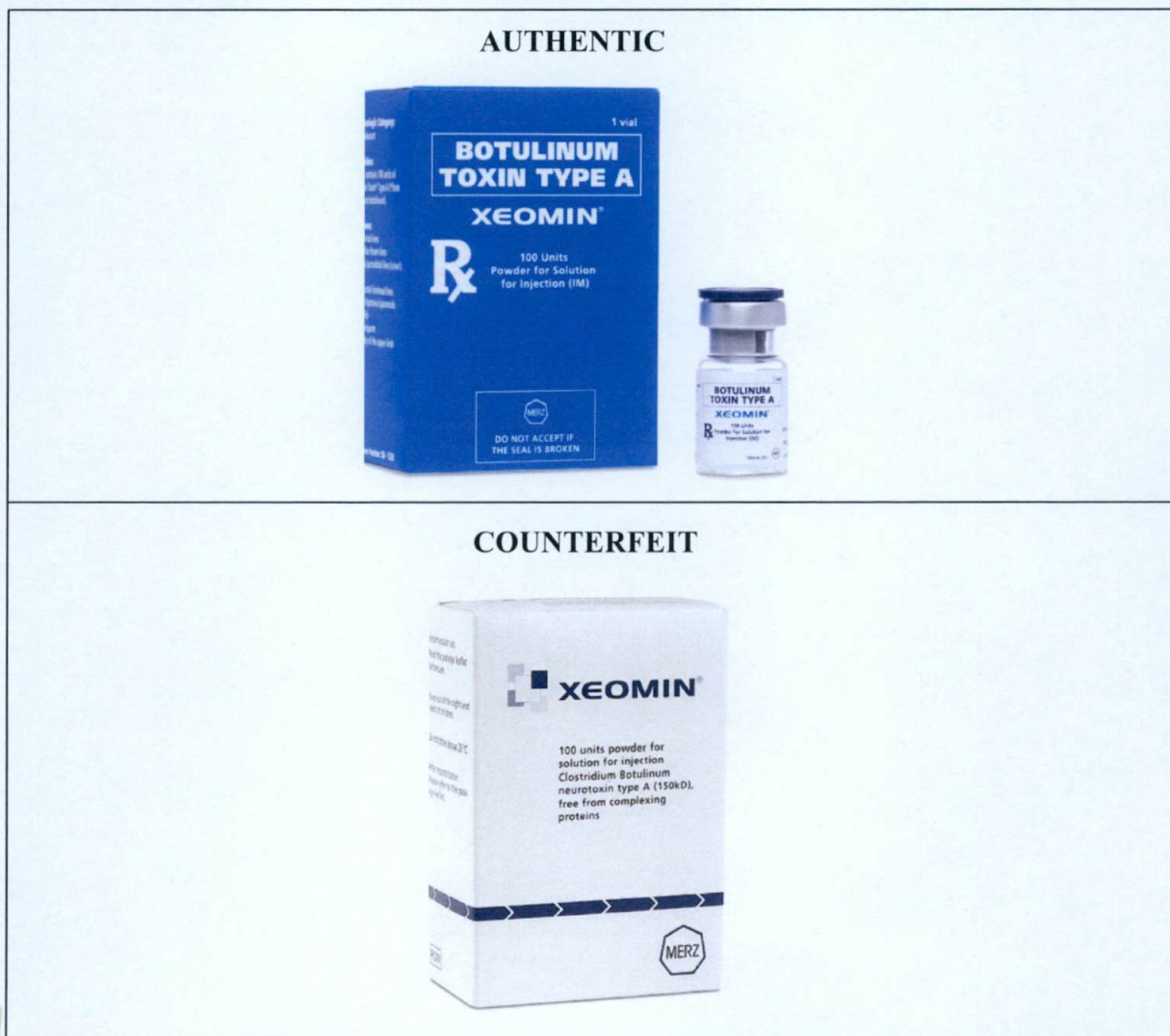
Figure 1. Comparison between the Authentic and Verified Counterfeit Xeomin 100 units powder for solution for injection Clostridium Botulinum neurotoxin type A (150kD). free from complexing proteins

The Food and Drug Administration (FDA) advises the public against the purchase and use of the counterfeit version of the following product: