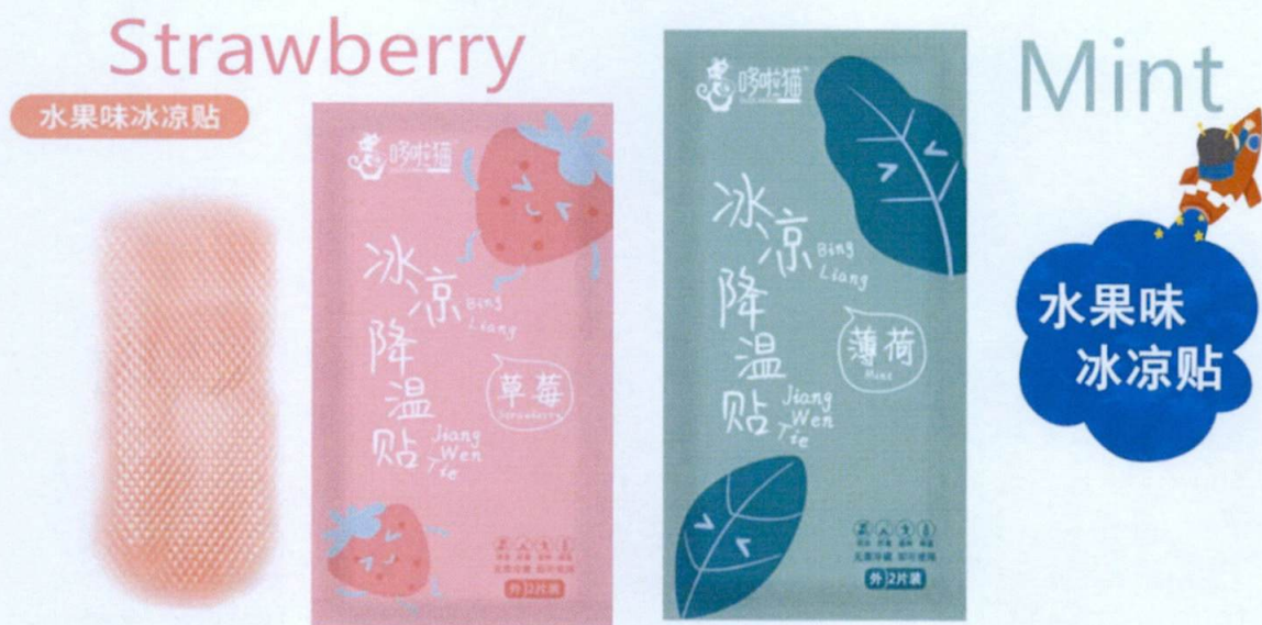
Figure 3. Unnotified Cooling Gel Patch (in Foreign Characters) advertised at Shopee.com.ph

The FDA verified through post-marketing surveillance that the abovementioned medical device product is not notified and no corresponding Product Notification Certificate has been issued. Pursuant to the Republic Act No. 9711, otherwise known as the “Food and Drug Administration Act of 2009”, the manufacture, importation, exportation, sale, offering for sale, distribution, transfer, non-consumer use, promotion, advertising or sponsorship of health products without the proper authorization is prohibited.