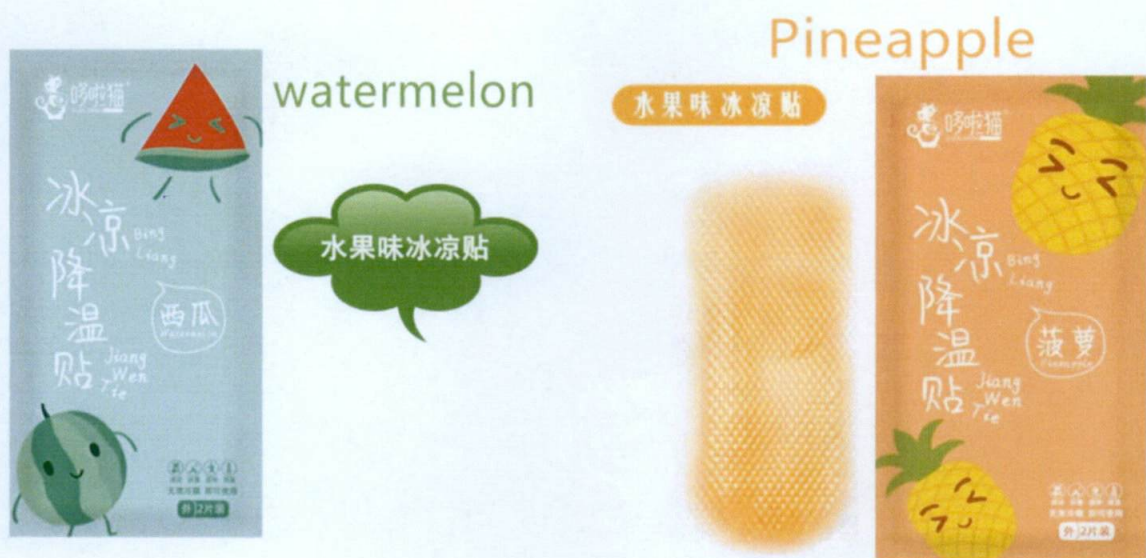
Figure 2. Unnotified Cooling Gel Patch (in Foreign Characters) advertised at Shopee.com.ph