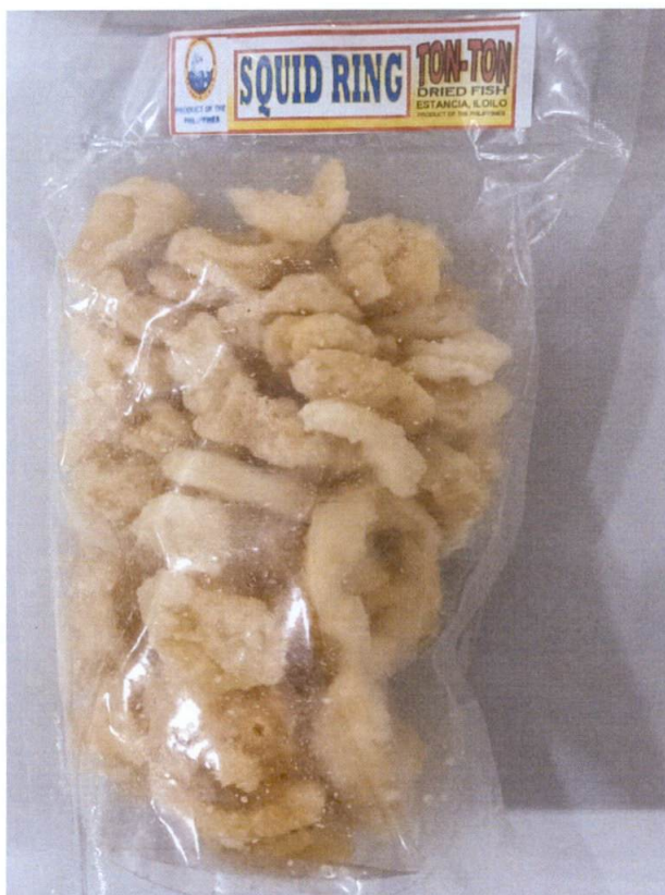
Figure 1. Unregistered TON-TON Squid Ring

The Food and Drug Administration (FDA) warns all healthcare professionals and the general public NOT TO PURCHASE AND CONSUME the unregistered food product: