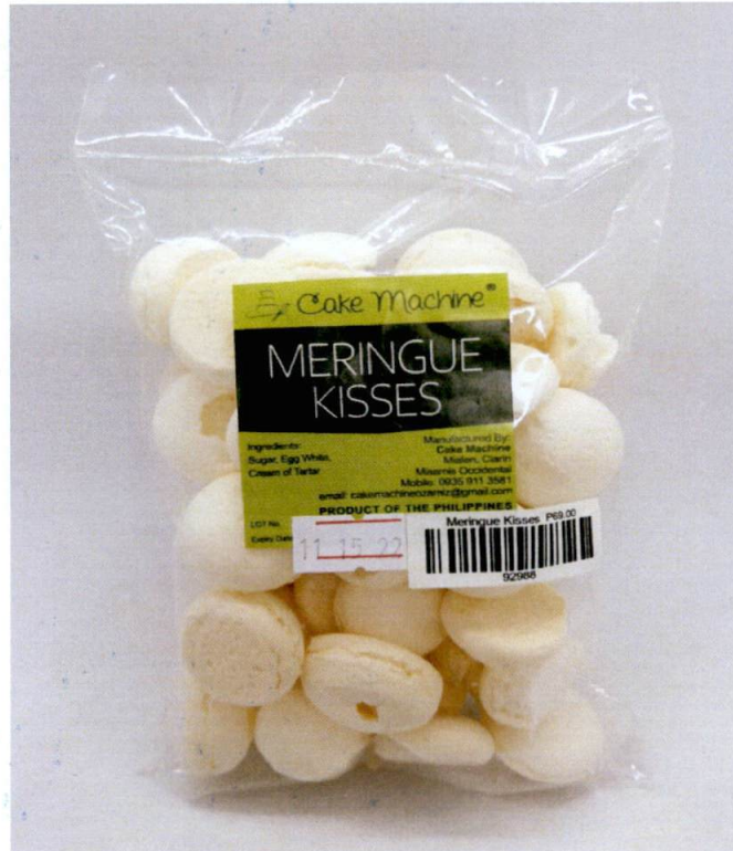
Figure 1. Unregistered CAKE MACHINE Meringue Kisses

The Food and Drug Administration (FDA) warns all healthcare professionals and the general public NOT TO PURCHASE AND CONSUME the unregistered food product: